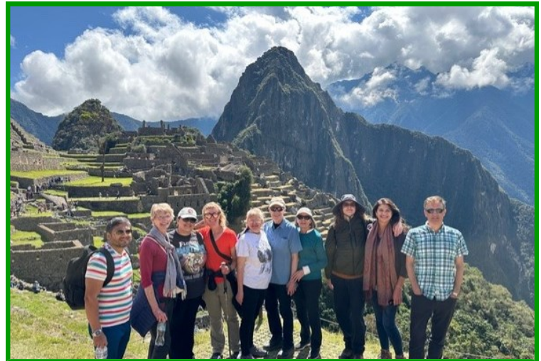
Study Tour participants amazed by the sheer beauty of Machu Picchu.