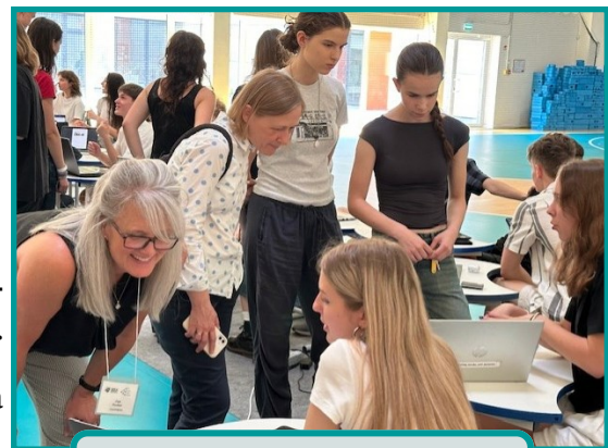
U.S. teachers talk with Lithuanian students about their research projects.

Watch the GEEA website for dates and application information.